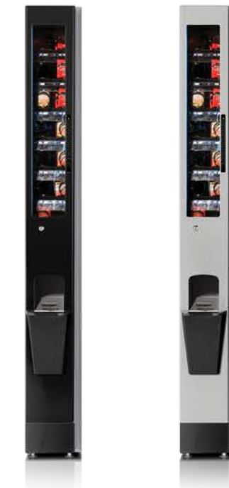
side ◀ dispenser

To be placed on the left of the hot beverages machine.