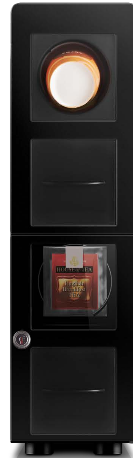
C80/D/T - R