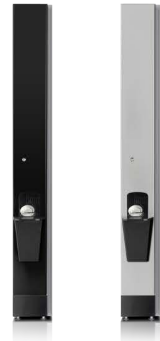
side ◀ lids