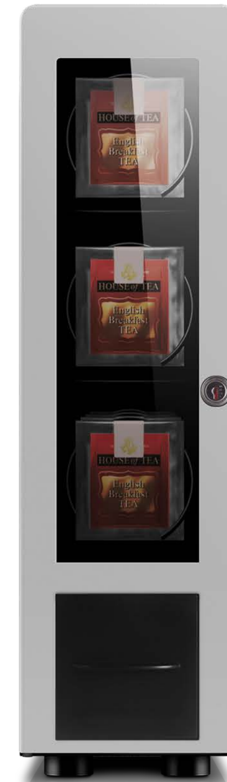
T/T/T - L