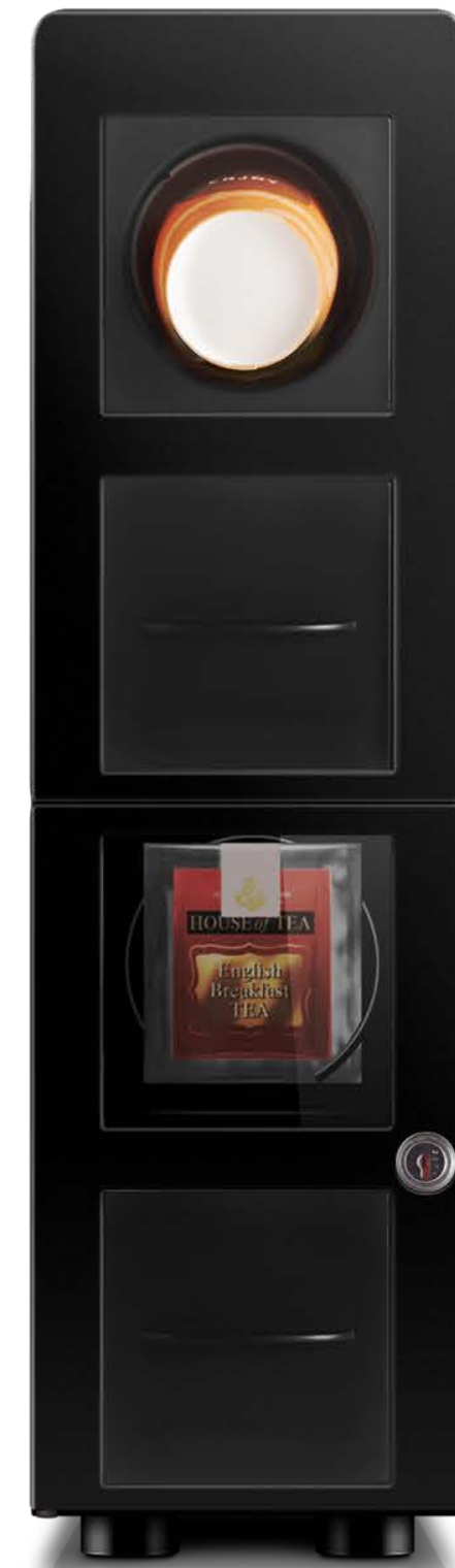
C80/D/T - L