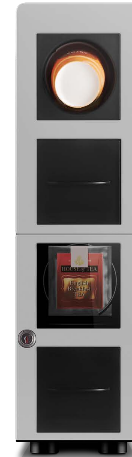
C80/D/T - R