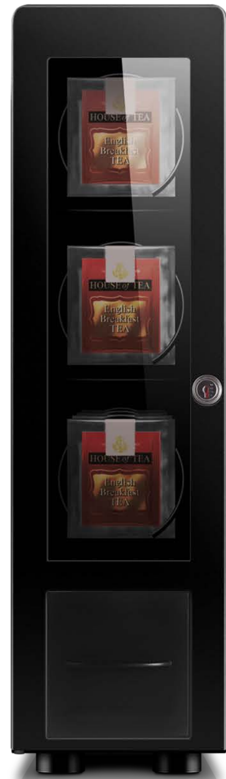
T/T/T - L

Spiral modules for the dispensing of teabags and infusion bags. The 2 lower areas are fixed, while the 2 upper ones can be configured either for lids, cups, drawers or both for teabags. It can be placed on the right or left side of the coffee machine.