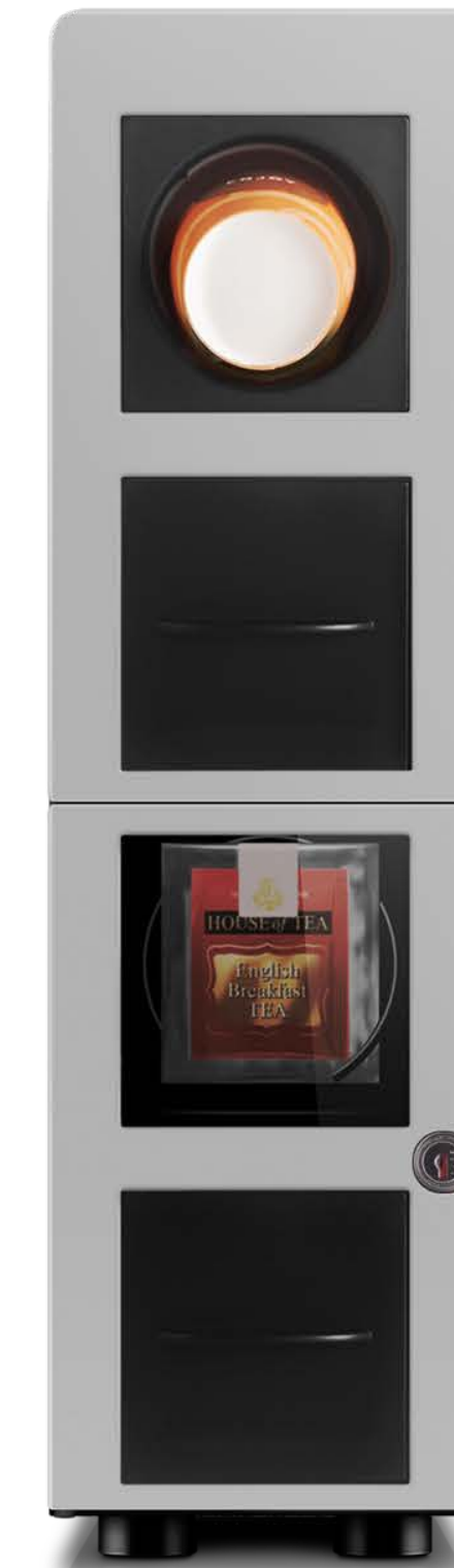
C80/D/T - L