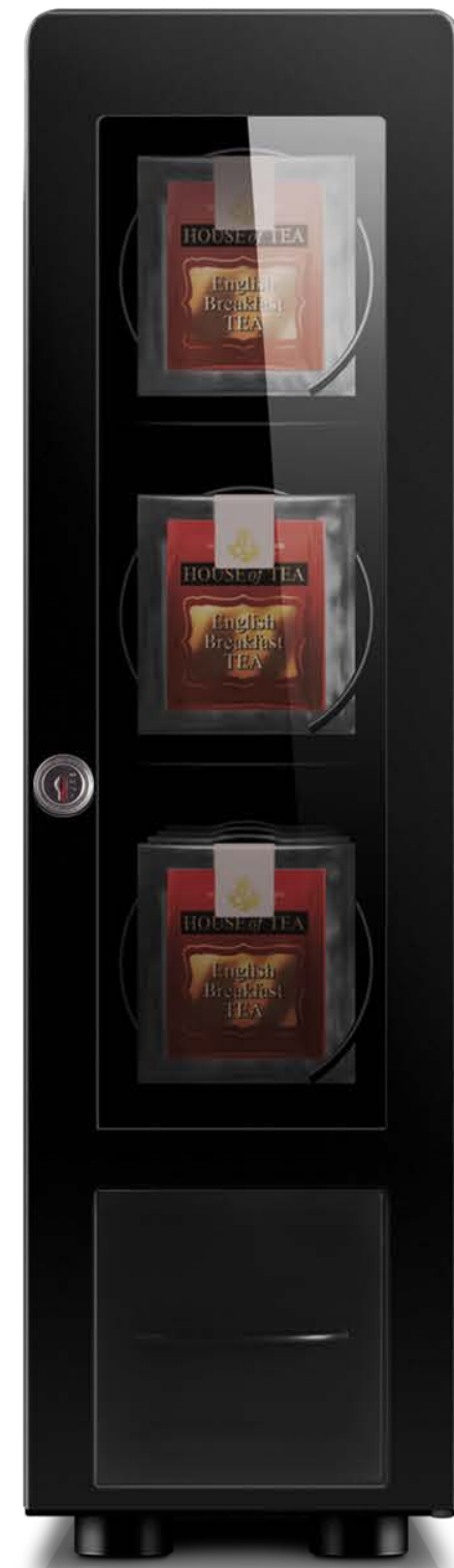
T/T/T - R