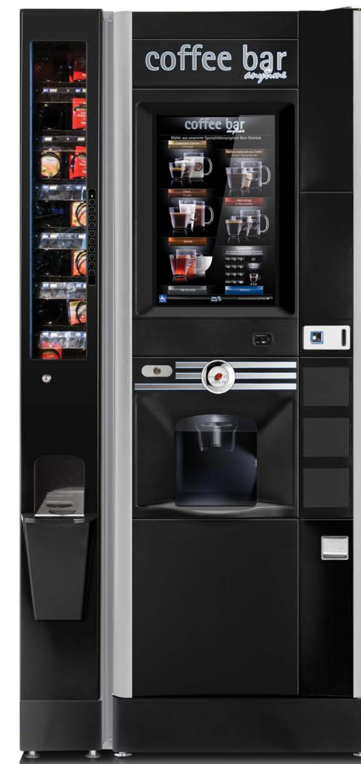
side < dispenser + Luce X2 touchTV