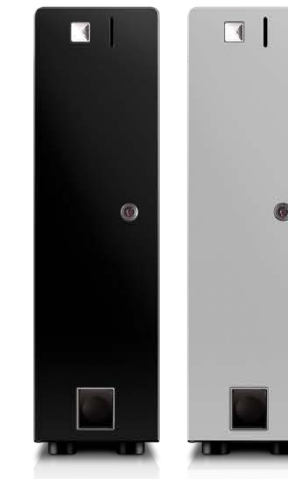
modul◀on change giver

Configuration Modular with drawers, cups and lids for coffee to-go.