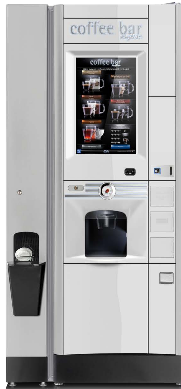
side < lids + Luce x2 touchTV