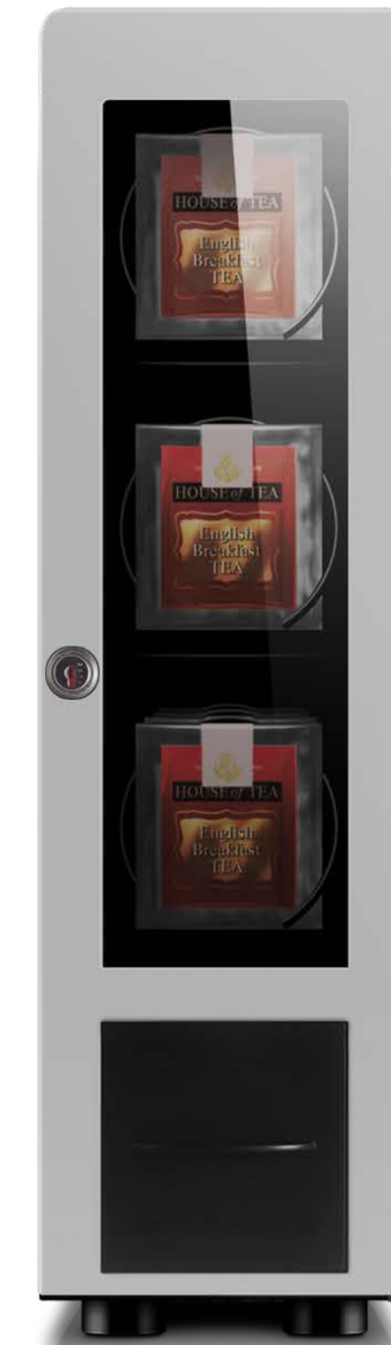
T/T/T - R