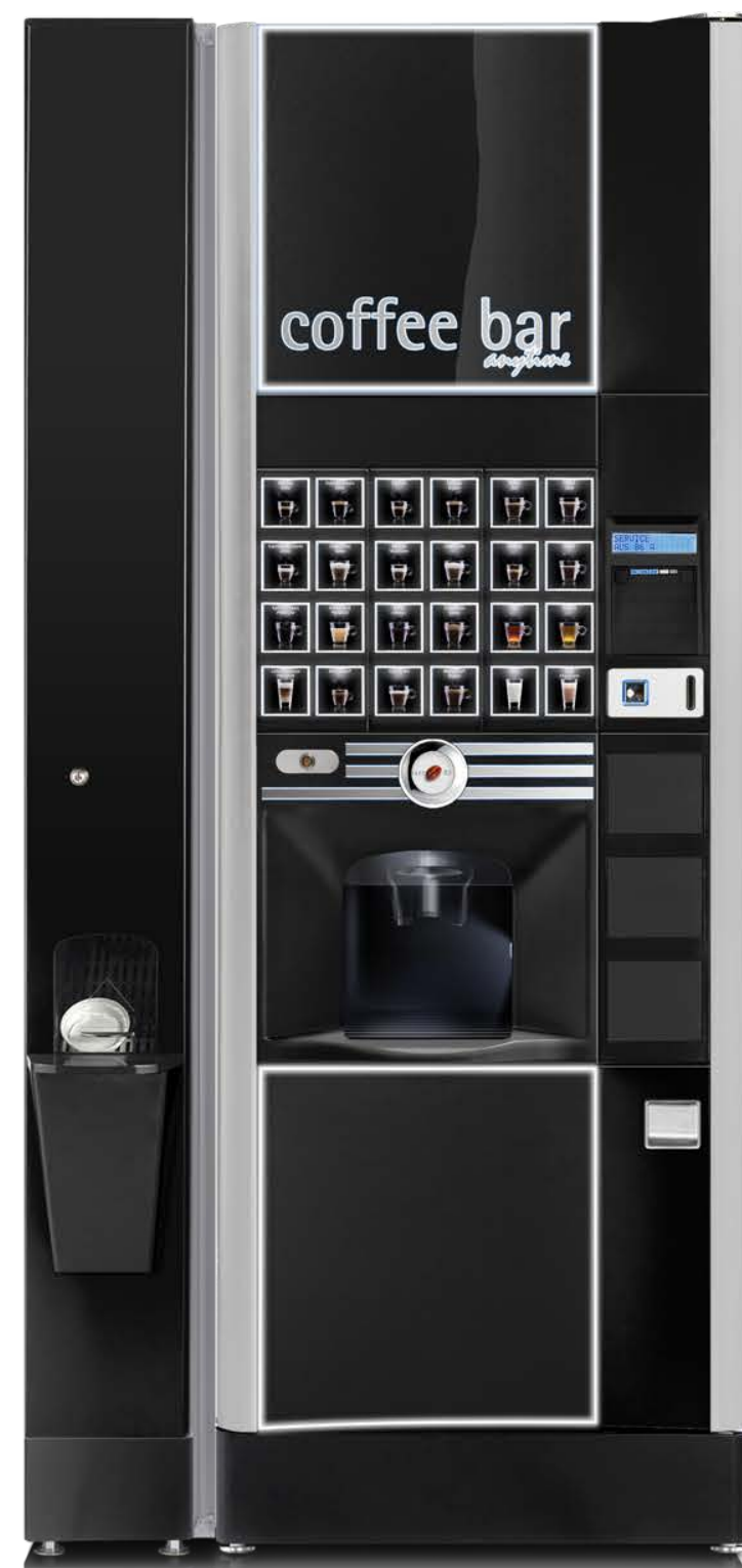
side < lids + Luce x2

A range of modules for perfectly combining free standing machines for the best possible customer experience. Two families are available: lid dispensers and teabag/infusion bag dispensers.